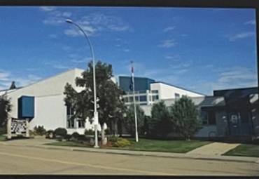
EDMONTON CHRISTIAN HIGH SCHOOL - 2004-PRESENT