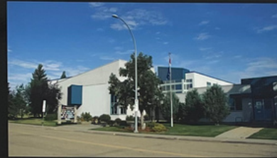
EDMONTON CHRISTIAN HIGH SCHOOL - 2004-PRESENT

What if my school work could make the world a better place?