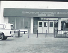
EDMONTON CHRISTIAN HIGH SCHOOL - 1980s

"The place God calls you to is the place where your deep gladness and the world's deep hunger meet."