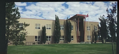
EDMONTON CHRISTIAN NORTHEAST SCHOOL - 2008-PRESENT