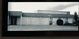
EDMONTON CHRISTIAN NORTH SCHOOL - 1969-2008

BIBLE VERSE - - - - - ISAIAH 49:16 I have engraved you on the palms of my hands.