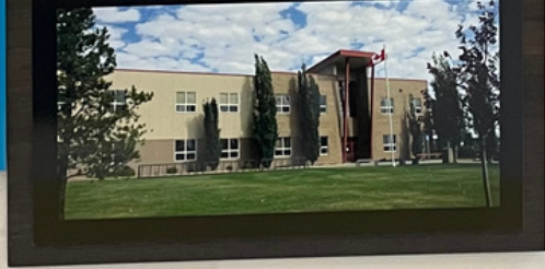
EDMONTON CHRISTIAN NORTHEAST SCHOOL - 2008-PRESENT