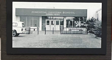
EDMONTON CHRISTIAN HIGH SCHOOL - 1980s

"The place God calls you to is the place where your deep gladness and the world's deep hunger meet."